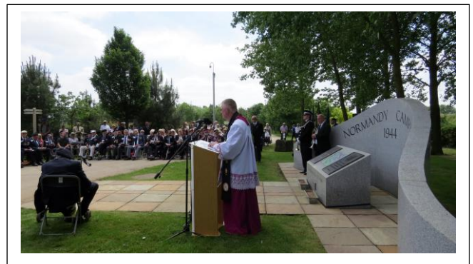
Veterans and supporters gather at the National Memorial Arboretum