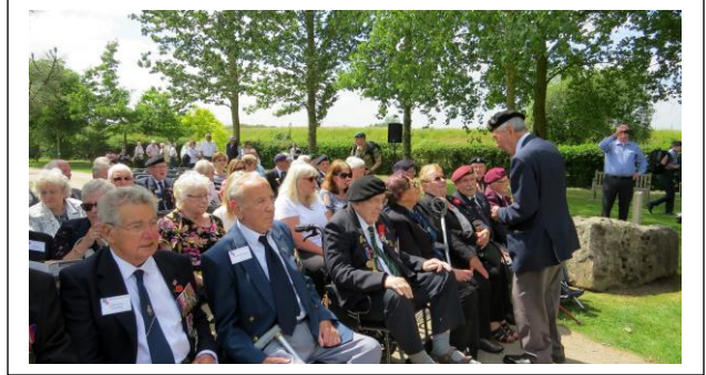
National Memorial Arboretum