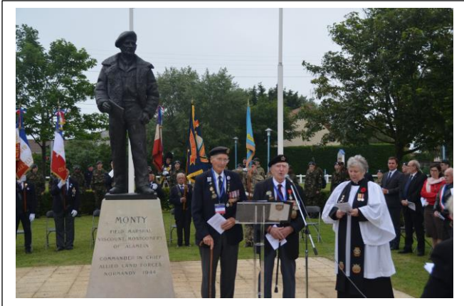
Service at Colleville Montgomery

As in past years the service concluded with a march past followed by a Vin d'Honneur on the sea front, hosted by the Community of Colleville Montgomery.