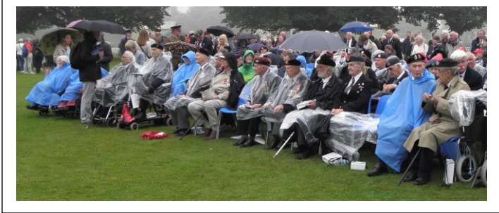
Bayeux CWGC Cemetery