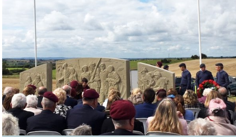
Unveiling of Friends of the Tenth Memorial Somerby.