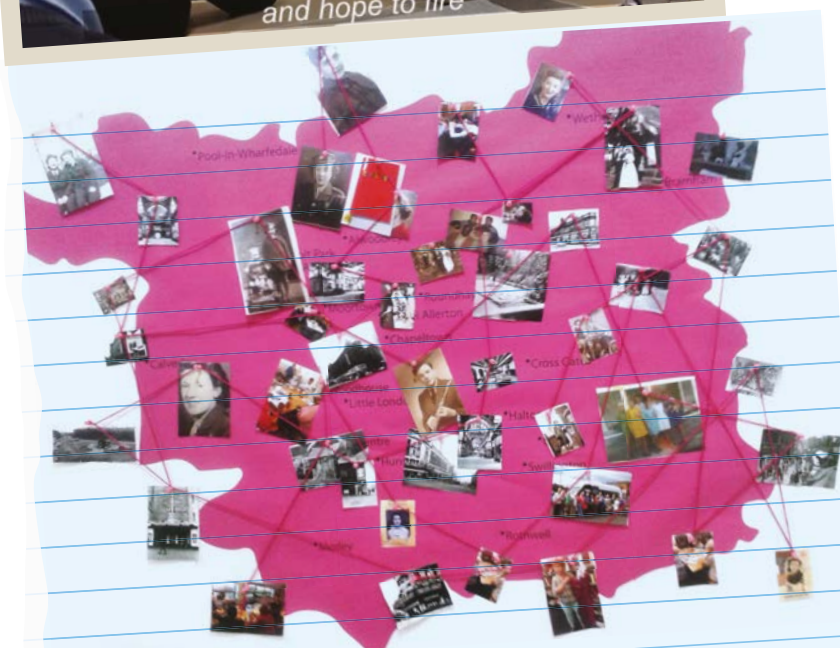
Mapping Leeds, reminiscence and shared experience