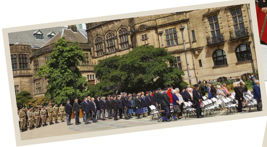
Armed Forces Day