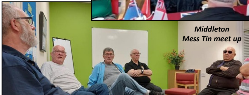
Middleton Mess Tin meet up