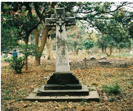
Memorial to the 87 men, women and children of the 1 st Battalion The Buffs who died in the cholera epidemic of 1867. Meerut, India.

Did you know that BACSA is the only established organisation looking after the many hundreds of former European cemeteries, isolated graves and monuments in the area from the Red Sea to the China Coast? The Commonwealth War Graves Commission's remit only covers graves from the two World Wars.